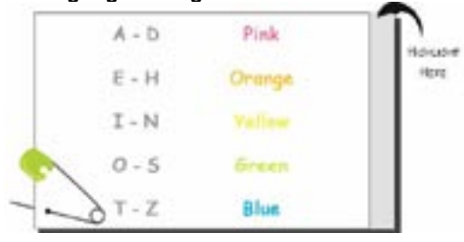
HINT: use a spare index card to create a straight line.